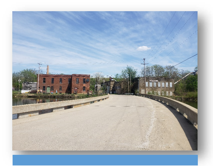
WELCOME TO ALLEGAN'S ISLAND!